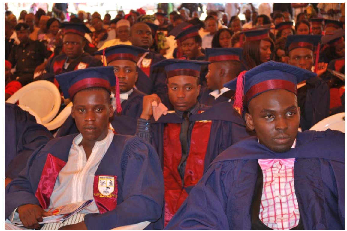
Graduating Students at the 2012 Convocation