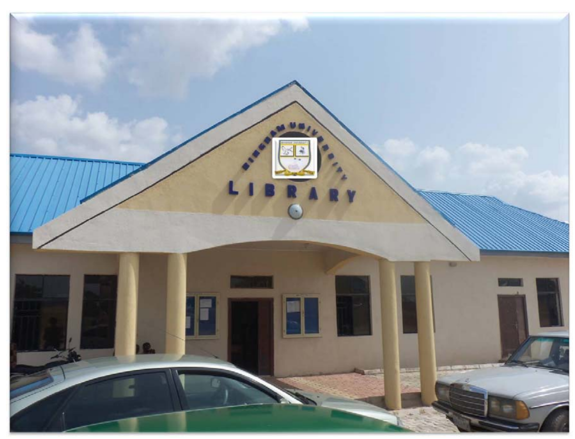
Bingham University Electronic Library