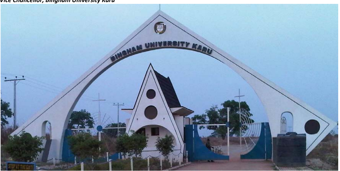
Main Entrance Gate of the Bingham University, Karu